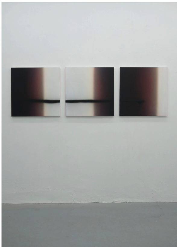
"James fragmentation 4", acrylique sur toile, 60 x 60 cm (x3), 2020

Please contact : info@micheleschoonjansgallery.be | +32 478 716 296